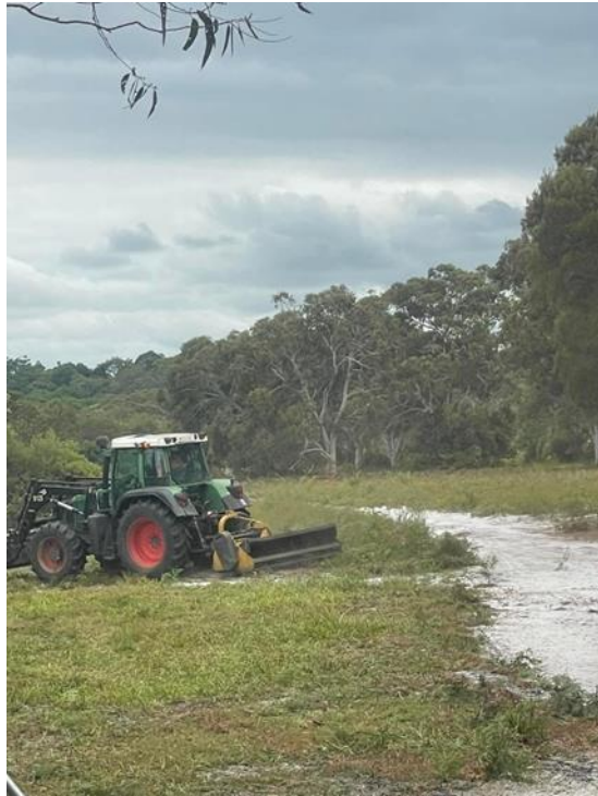
3 November 2023 above and below