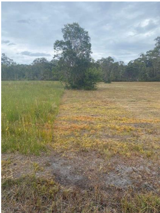
Wallum frog & froglet habitat destroyed