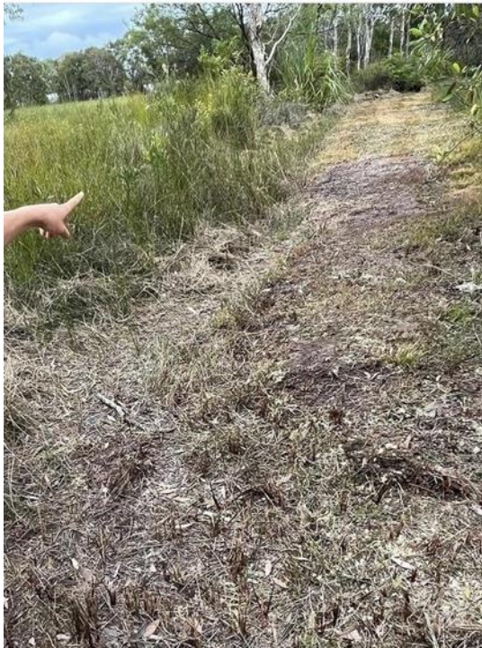
Wallum Frog & Froglet Habitat destroyed