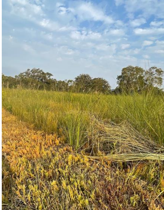
Wallum Heath & Coastal Swamp destroyed