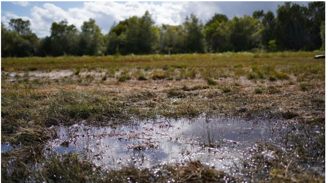
Wallum Frog & Wallum Froglet Habitats including other species recently slashed and destroyed.