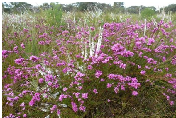
Early October pre slashing hectares of wildflowers wallum heath & coastal swamp destroyed.