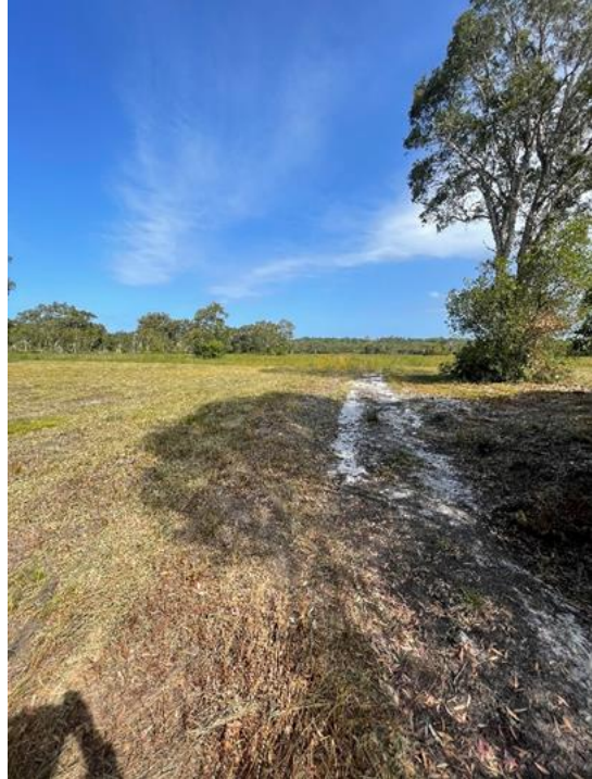
Slashing 13 October 2023