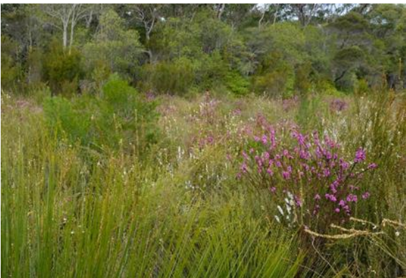
Early October Pre-slashing eastern boundary pre -slash & remaining small patch of heath now fenced