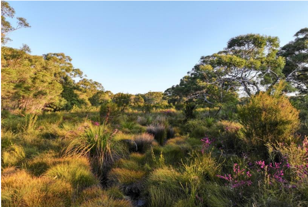
This is what rich biodiversity with extreme high conservation value looks like & why it should be preserved.