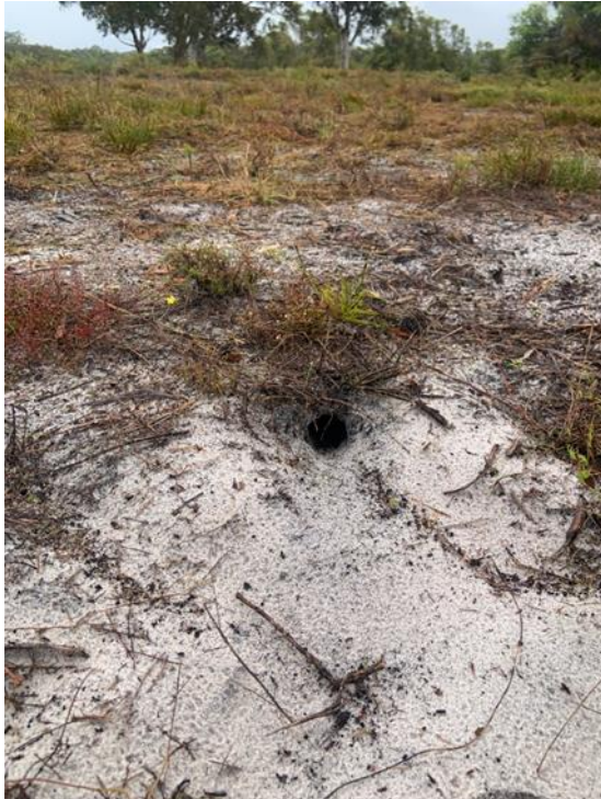
Numerous honeybee eater nests destroyed